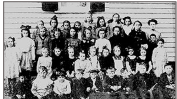
Bay Head School 1907

Our current exhibit, The Bay Head School , is evolving as members and visitors add information. The Bay Head School shared class photographs, ranging from 1907 to 2018, many without names. We are encouraging people to visit and help us identify those in the photographs. When completed they will be reprinted with names and returned to the school. On display are text books and training materials. Dick and Jane books, of course, second and third grade books with vocabulary words and math problems which would challenge an eighth grader without a calculator. We continue to seek information about the Bay Head School and in the true sense of keeping history relevant and accurate, we call on the community for input.